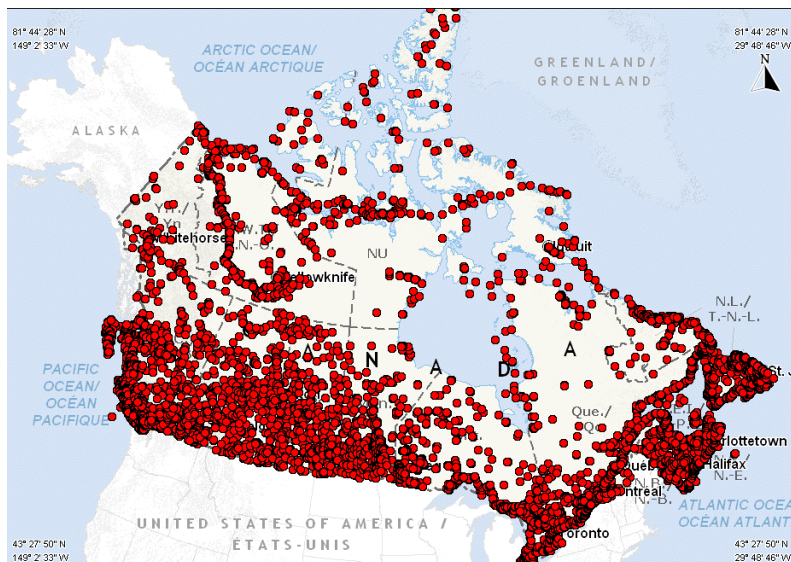
Figure 2. Federal Contaminated Sites (downloaded from Treasury Board website during the 2000s)

Canada has many toxic sites, many of which were abandoned by multinational companies and became the responsibility of the Crown. Treasury Board accounting considers toxic sites long term liabilities. It is crucial to the long term health of the environment, citizens and the economy that economic boom (often bolstered with subsidies, as for the resource industries) is not followed by long term costs to future generations.